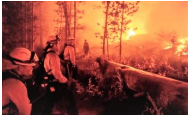
Along SR-50 Near So. Lake Tahoe (above)

The rest of these photos were taken randomly on Hwy 50 and in the South Lake Tahoe Region.